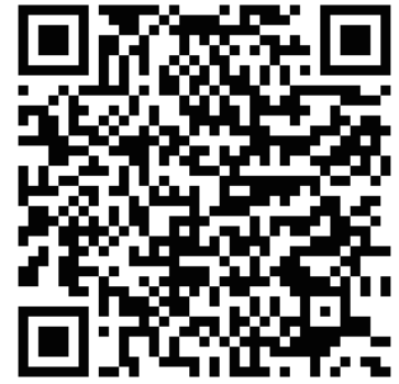
招標設定地上權 ITT for the establishment of superficies