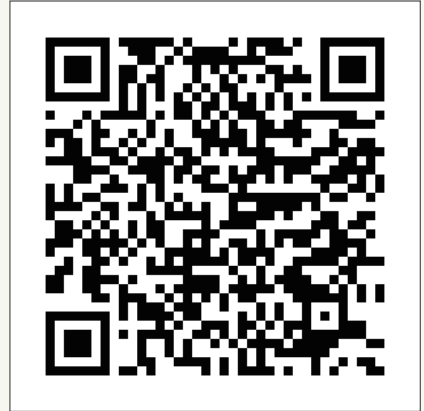
招標設定地上權 ITT for the establishment of superficies